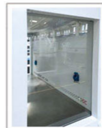
The Side Window