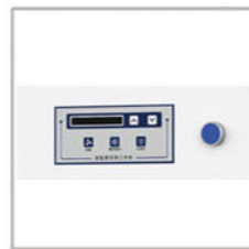
The Display of BKCB-V500