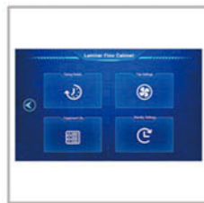
7-inch Color Touch Screen Airflow Level